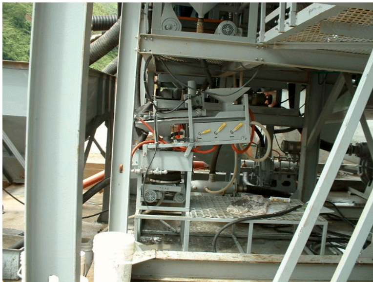
Magnetic Separator in Peru

It is recommended that the magnet material separated be run back through the separator until the final operating parameters are set.